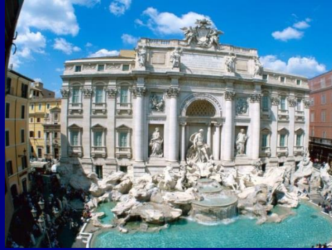
The Trevi Fountain: