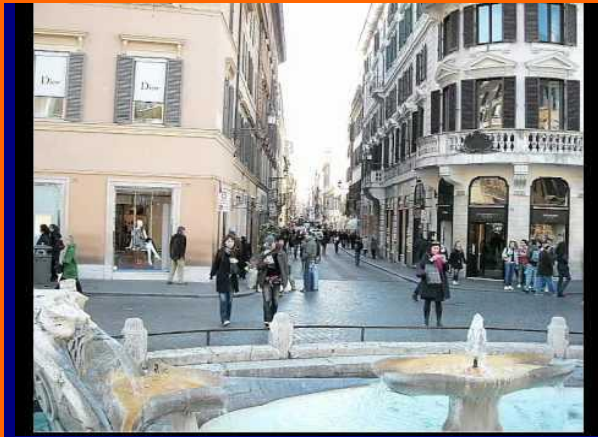
Via Frattini/Via Condotti - Shopping Distance from Hotel in Taxi/Car: 14.2km Distance from via Petroselli: 1.10km Closest Metro stop: Spagna