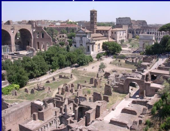
The Roman Forum