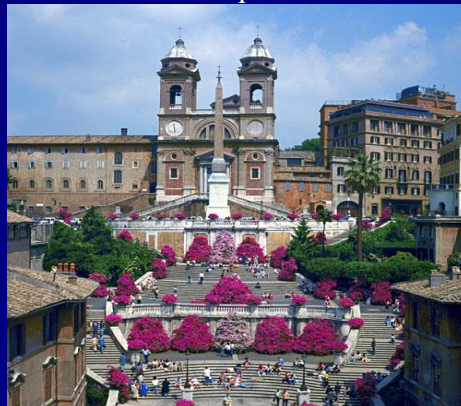
The Spanish Steps