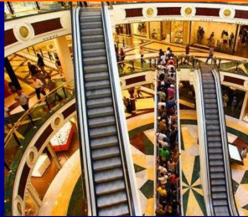
EUROROMA2 – The largest Shopping Centre in EUROPE Distance from Hotel in Taxi/Car: 12km Closest Metro stop: EUR Fermi

For those Course participants interested, a Sight Seeing Trip can be organised one evening during the course, visiting, the Coliseum, Spanish Steps, the Pantheon, Trevi Fountain and Piazza Navona stopping off for an evening meal at a restaurant close to the Trevi Fountain.